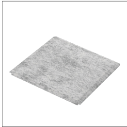
Filter standard/hypoallergenic (see table below)