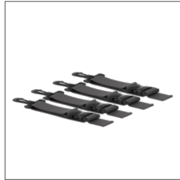
Mobi mounting straps (4) 35055