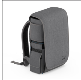
Mobi backpack 35050