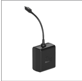
Mobi external battery 35052