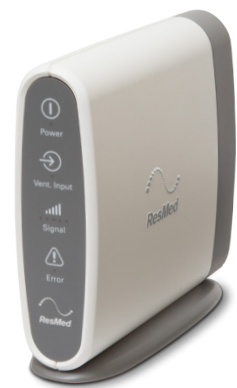
ResMed Connectivity Module

Find out more about how this solution can effectively help you improve your business while providing better care by visiting ResMed.com/Astral .